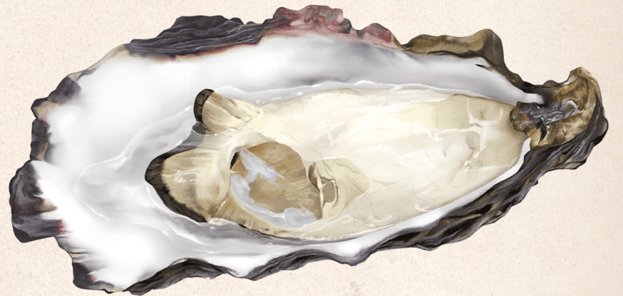
UNCOOKED SHELLFISH Vibriosis