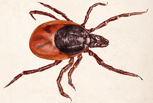
BLACK-LEGGED DEER TICK Powassan virus