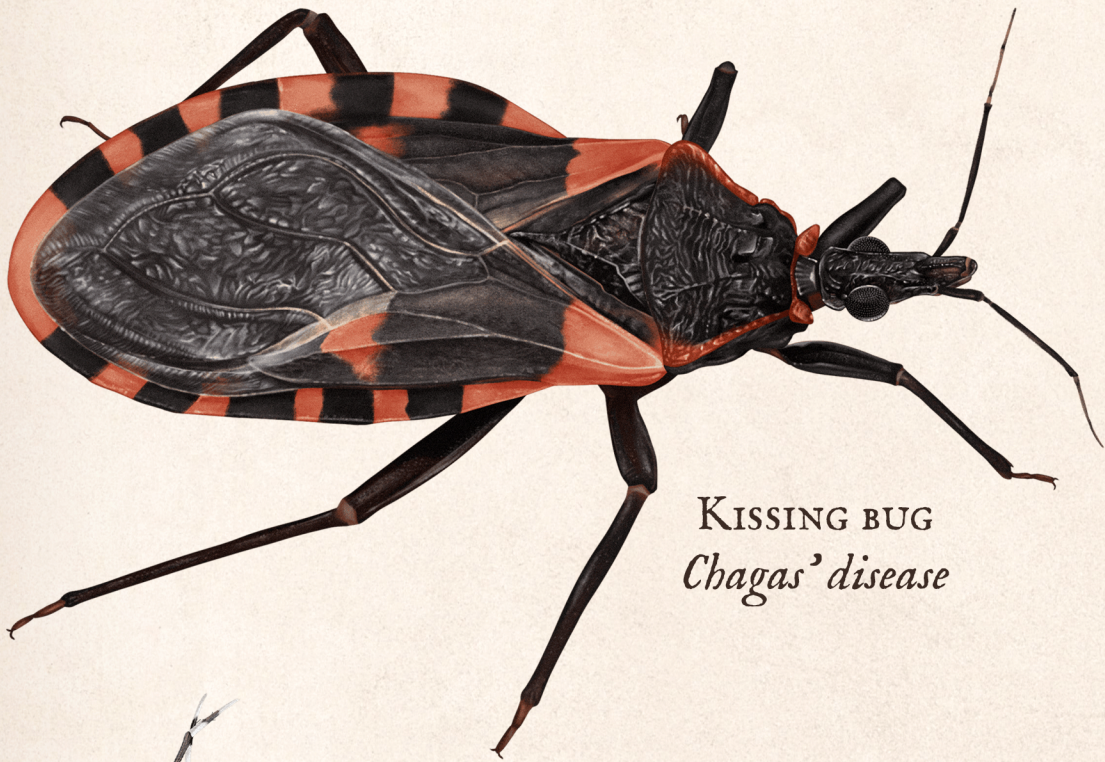
KISSING BUG Chagas' disease