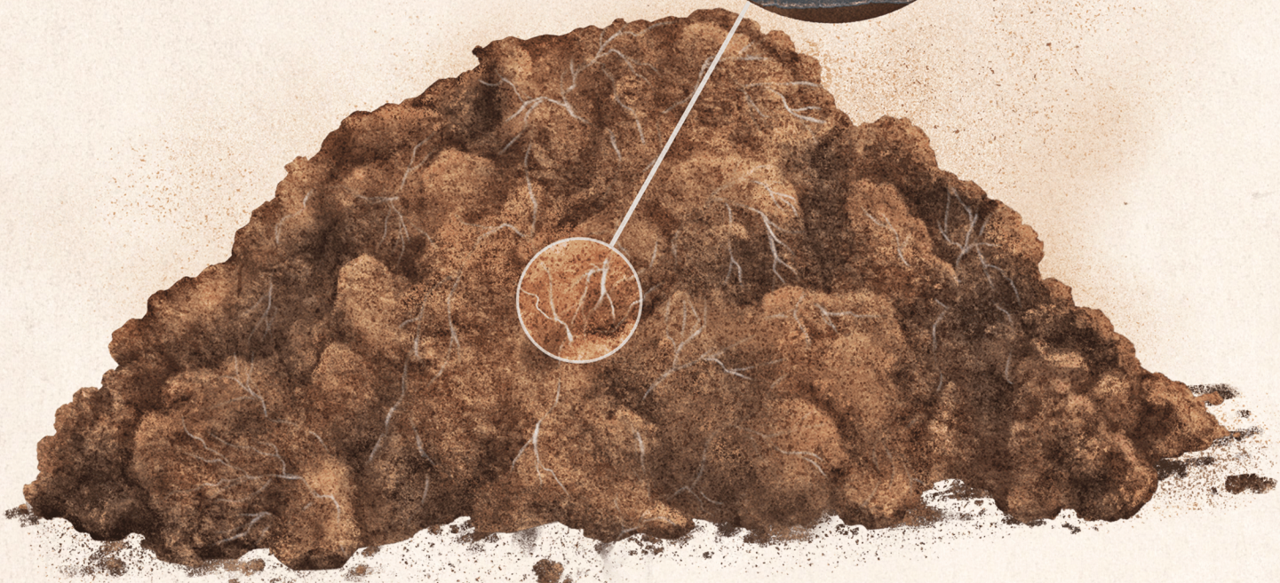
COCCIDIROIDES FUNGUS Valley fever