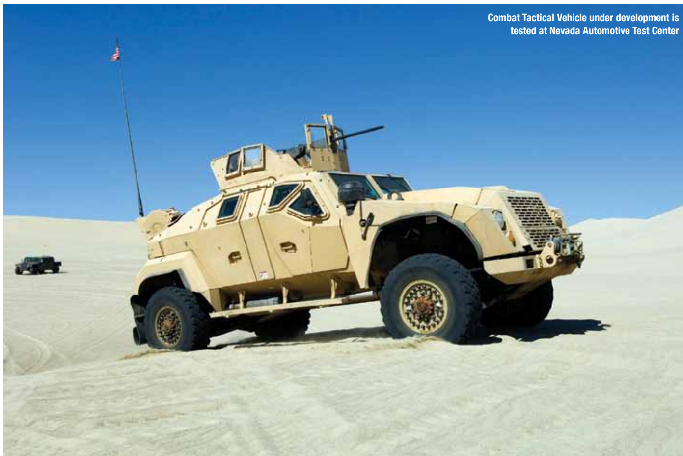
Combat Tactical Vehicle under development is tested at Nevada Automotive Test Center

[W]hat [the Joint Capabilities Integration Development System] 35 currently calls “capability” is actually the theoretical performance of a platform or system unconstrained by the logistics tail required for its operation. But tail takes money, people, and materiel that detract from tooth. True net capability, constrained by sustainment, is thus the gross capability (performance) of a platform or system times its “effectiveness factor”—its ratio of effect to effort: