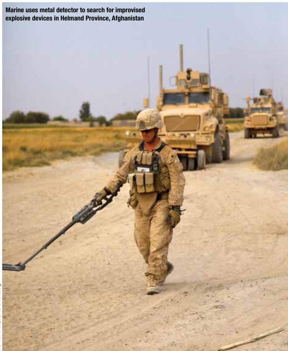
Marine uses metal detector to search for improvised explosive devices in Helmand Province, Afghanistan

A lean or zero fuel logistics tail also increases mobility, maneuver, tactical and operational flexibility, versatility, and reli-