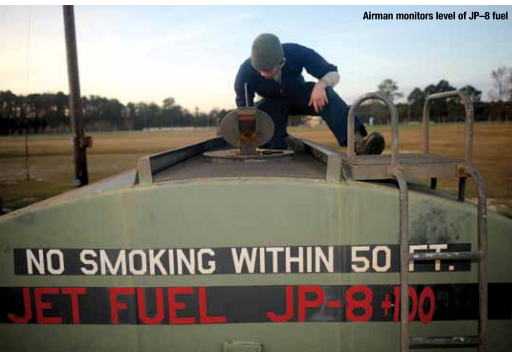
Airman monitors level of JP-8 fuel

Logistics uses roughly half the Department's personnel and a third of its budget. One-fifth of DOD's oil—at least 90 million