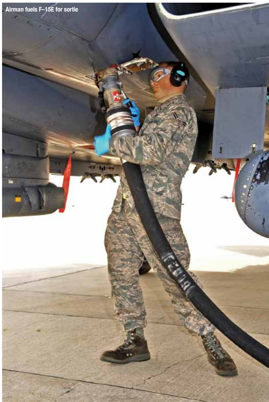
Airman fuels F-15E for sortie

In contrast, the DSB task force expressed “strong concerns” about the coal-to-liquids synfuels favored by the Air Force and Navy (but illegally carbon-intensive under a 2007 law), finding they “do not contribute to [solving] DOD's most critical fuel problem—delivering fuel to deployed forces,” “do not appear to have a viable