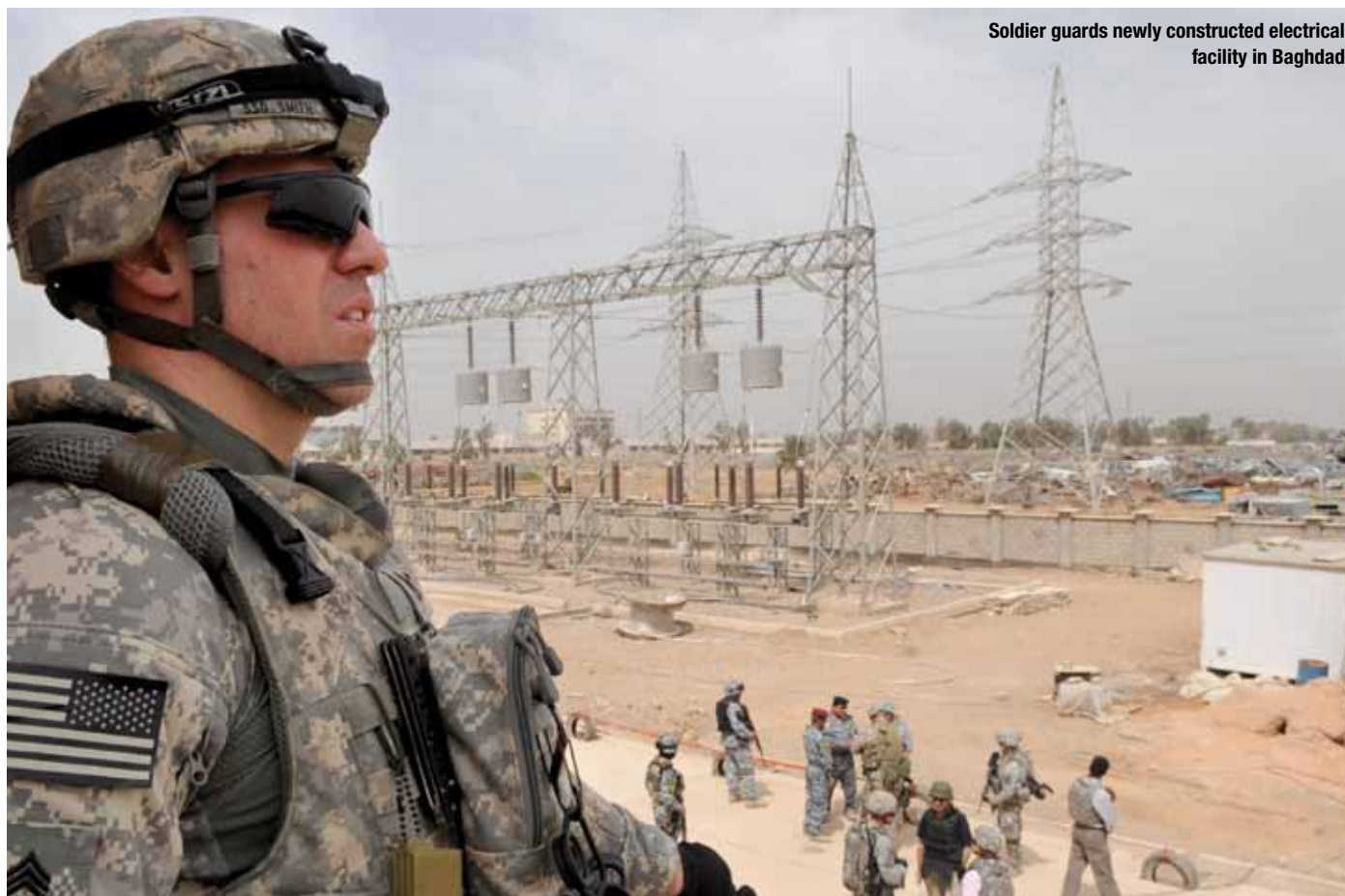
Soldier guards newly constructed electrical facility in Baghdad

whether we care most about national security, climate change, or jobs and competitiveness, we should do exactly the same things about energy