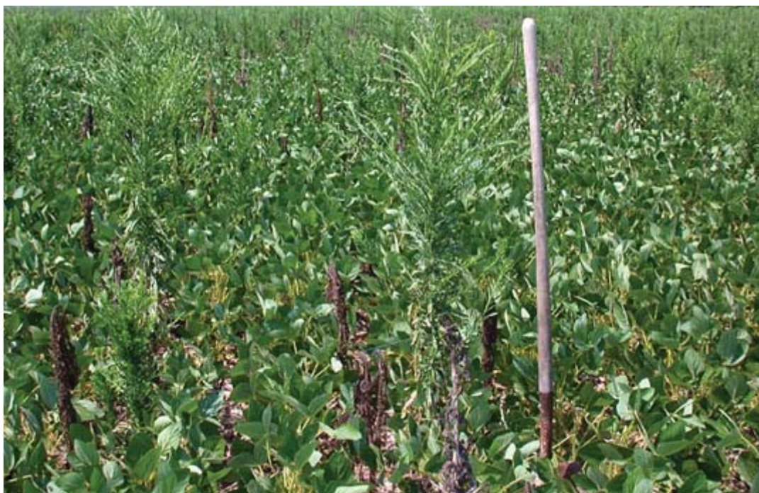
Heavy infestations of resistant weeds in cotton fields reduce crop yields and increase costs of production. Resistant populations of weeds can grow as tall, or taller than a hoe handle and produce several hundred thousand seeds per plant.

Bt cotton has now been grown for 14 years, but the acreage planted to it did not reach one-third of national cotton acres until 2000. Plus, the first populations of Bt resistant bollworms were discovered in Mississippi and Arkansas