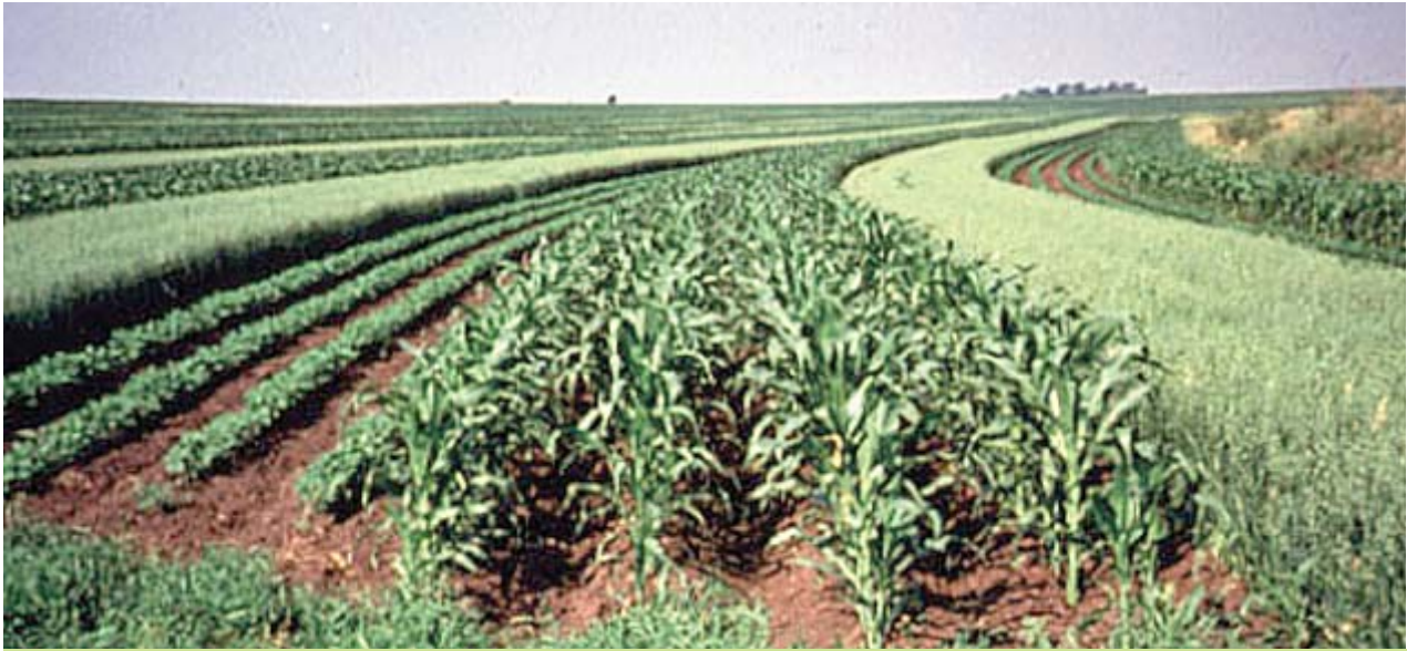
Corn and soybean strip-cropping systems reduce weed and insect pressure and lessen reliance on pesticides and GE crops