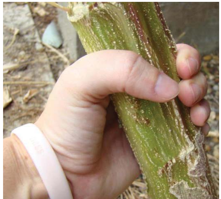
The stalk of a mature Palmer amaranth weed can reach six inches in diameter, and can damage mechanical cotton pickers.

The widespread adoption of glyphosate-resistant (GR), RR soybeans, corn, and cotton has vastly increased the use of glyphosate herbicide. Excessive reliance on glyphosate has spawned a growing epidemic of glyphosate-resistant weeds, just as overuse of antibiotics can trigger the proliferation of antibiotic-resistant bacteria.