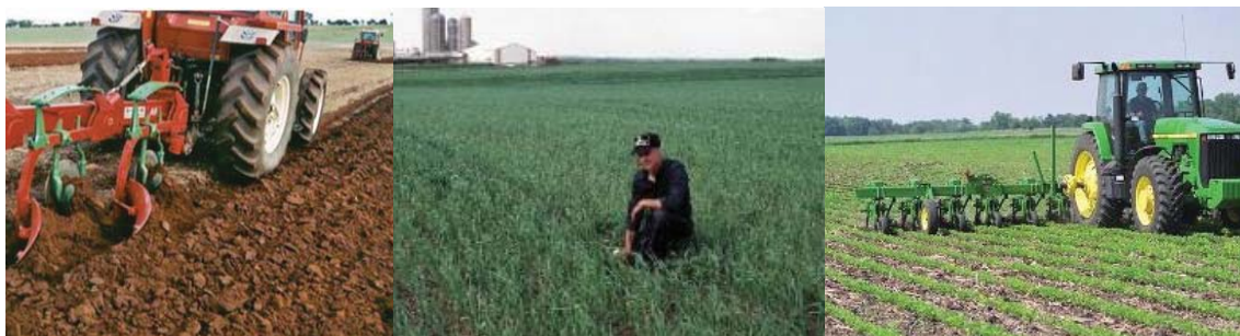
Farmers will have to diversify weed management tactics and systems to deal with HR weeds. Deep tillage (left photo) buries weed seeds; cover crops (center) can repress weed germination and growth; and mechanized cultivation between plant rows (right) is a proven alternative to herbicides.

cotton fields in 2003, about when experts predicted field resistance would emerge.