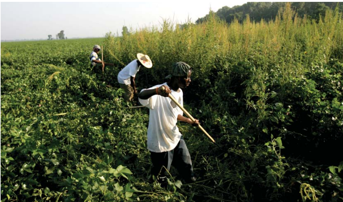
Farmers have resorted to hand weeding in an attempt to save cotton and soybean fields heavily infested with glyphosate-resistant Palmer amaranth.

Figure 1.1 shows the upward trend in the pounds of glyphosate applied per crop year 1 across the three HT crops. USDA NASS data show that since 1996, the glyphosate rate of application per