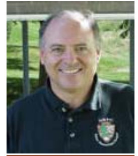
Name: Dan Kimball

Current Position Superintendent of the Everglades National Park & Dry Tortugas National Parks