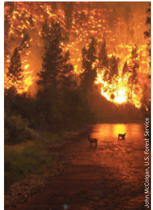
John McColgan, U.S. Forest Service

Similarly, an increase in the frequency of extreme wildfire events in scrub-shrub habitats will exacerbate the expansion of exotic invasive species such as cheatgrass. 27 This could lead to