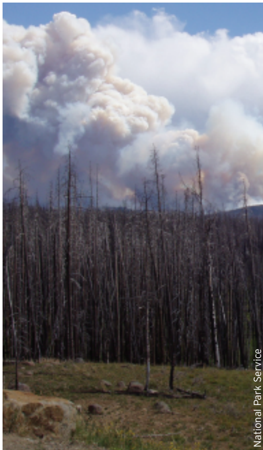
National Park Service

a rapid conversion of habitat types and place native species—including mule deer, pronghorn, and sage grouse—at risk. 28 The introduction of cheatgrass might even make some locations susceptible to more frequent fires. 29